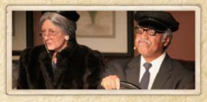
Henderson Civic Theatre - Driving Miss Daisy