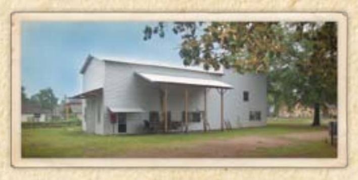
Depot Museum - Restored Cotton Gin