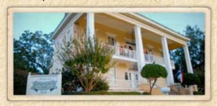
Howard Dickinson House