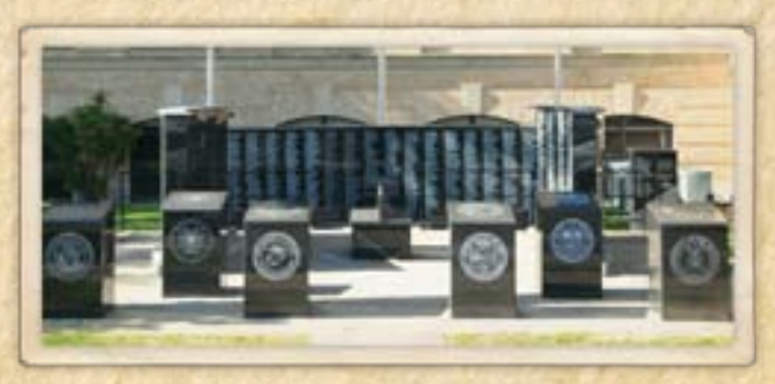
Veterans Memorial at The Rusk County Courthouse

The Henderson Country Club is a semi-private 9 hole golf course, located at 1143 State Hwy. 43. Closed on Mondays. 903-657-4719