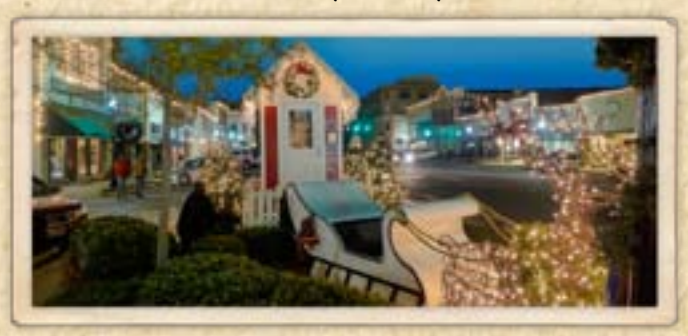
Spirit of the Christmas Season

The Henderson Sports Complex, located on Hwy. 259 South, is home to several youth recreation associations.