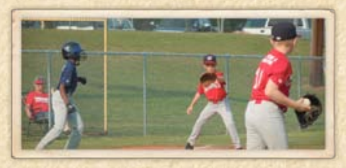
Henderson Sports Complex