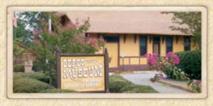
Depot Museum/Children's Discovery Center