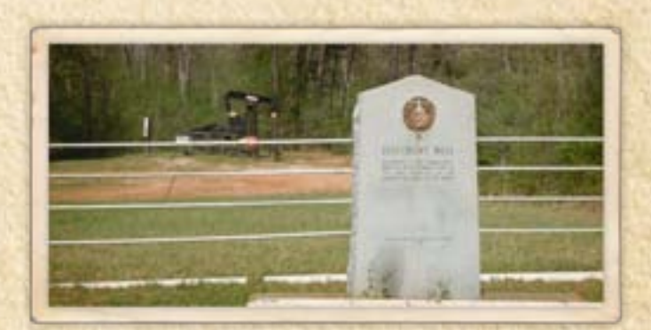
Daisy Bradford No. 3, Discovery Well First Oil Well in East Texas. Lead to the discovery of the largest oil