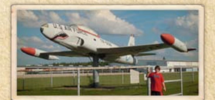
T-33 at the Rusk County Airport