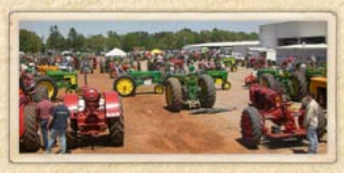
East Texas Antique Tractor Show

The Depot Museum/Children's Discovery Center and Operational Cotton Gin houses the Rusk County History Museum and Children's Discovery Center at 514 N. High Street. It is clustered on 5 acres with 12 restored structures from Rusk County's past. Texas Historical Markers have been awarded to the Walling Log Cabin, built in 1841, and the Arnold Outhouse, making it the only outhouse in Texas with a Historical Marker. The latest addition is a restored operational cotton gin. www.depotmuseum.com 903-657-4303.